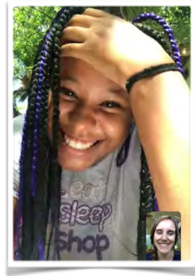
A Glimpse Into Online School